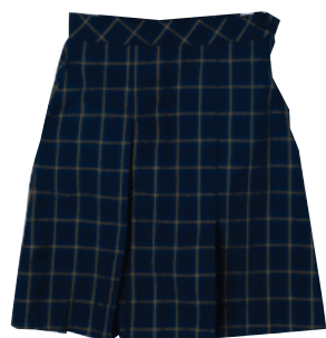
4002 Girls Winter Tunic - $57.00

Colour 9002 Navy/Royal/Gold Sizes 4 to 10