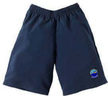
5333SH Unisex Shorts - $25.00

Navy / Full Colour Printed Logo front left leg. Sizes 4 to 16 - (Adults sizes available on request)