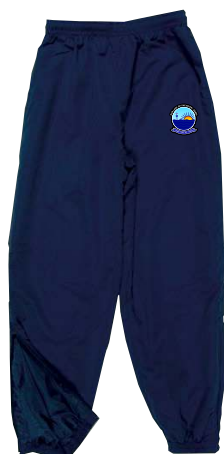
533P 88 Cuff Leg Track pants - $35.00

Navy Microfibre, cuff leg with zip Full Colour Printed Logo front left leg. Sizes 4 to 16. ( Adult Sizes on Request)