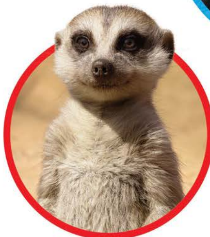
TIMON Species: Meerkat