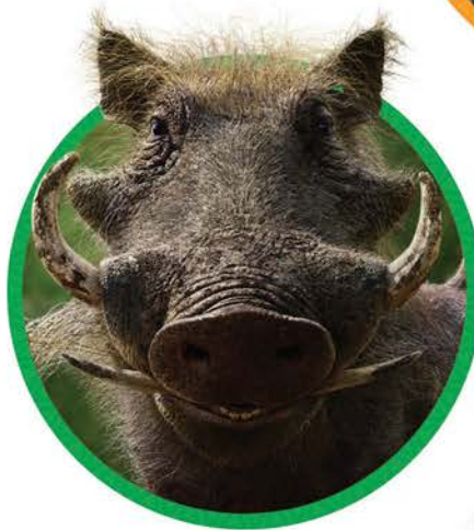
PUMBAA Species: Warthog