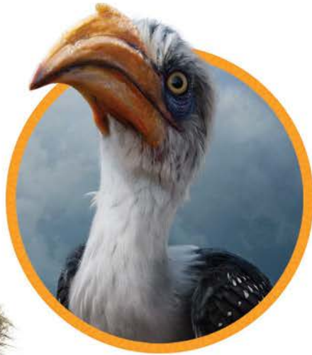
ZAZU Species: Hornbill

When a new prince is born, all of the animals in the Pride Lands travel to Pride Rock to pay their respect. As the animals make their way across the savannah, can you identify who left which pair of tracks?